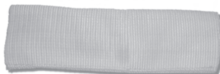
#6382 12" Mo-Flex Protective Pad