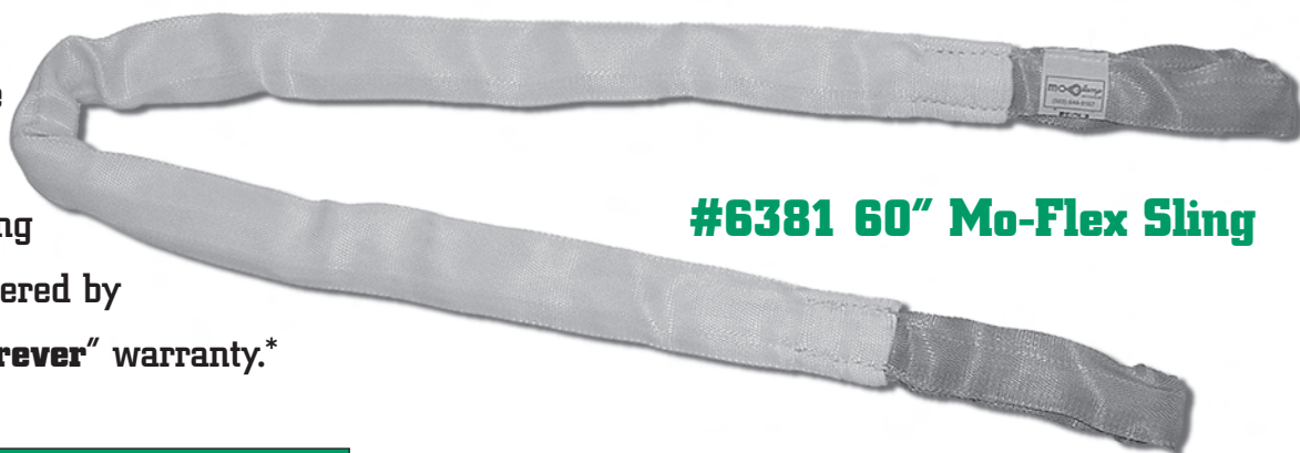
#6381 60" Mo-Flex Sling