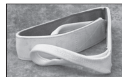
#6304 60" Sling w/Sewn Loops and Protective Backing