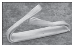
#6300 30" Nylon Sling