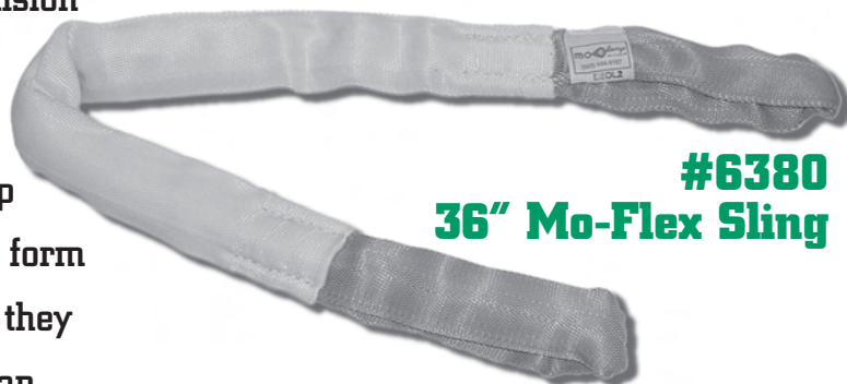
#6380 36" Mo-Flex Sling

MoClamp pioneered the use of slings in collision repair in the early 1980's. We now add to our existing product line with Mo-Flex Slings . Certain configurations can handle up to 10,000 lbs. Tough, extremely flexible and form fitting for a more uniform load distribution, they provide protection against damage chains can cause, in certain applications. Made in the USA to Mo-Clamp's exacting standards and covered by the Mo-Clamp " Forever " warranty.*