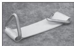
#6301 20" Nylon Sling w/Metal Triangles